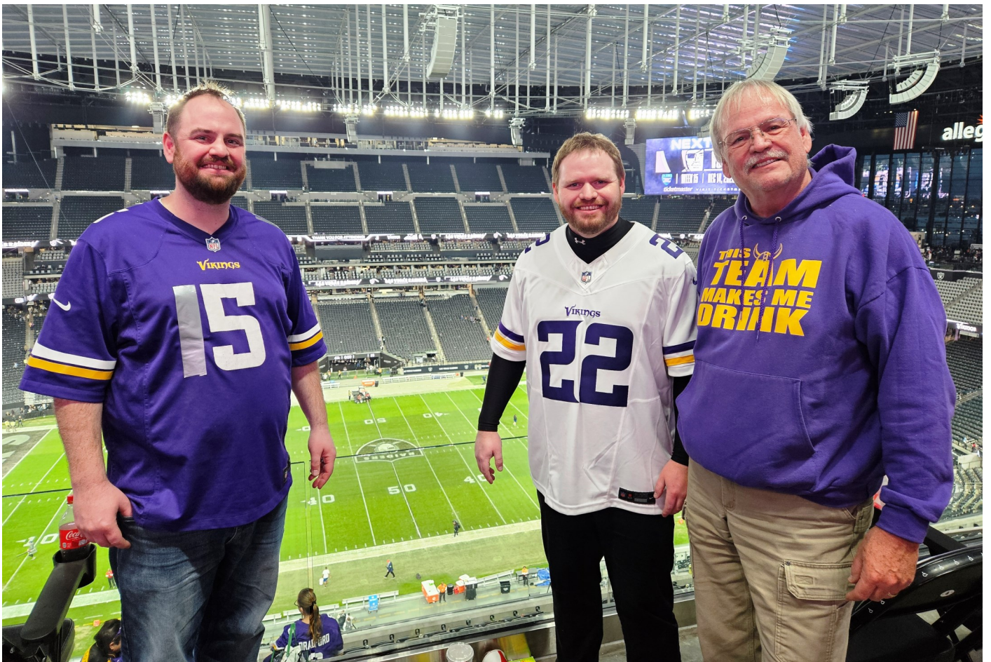
Here we are after the game in the stadium in Vegas. The Vikings beat the Raiders 3-0. Picture below is from the top of the Strat, some 900 feet up in the air.